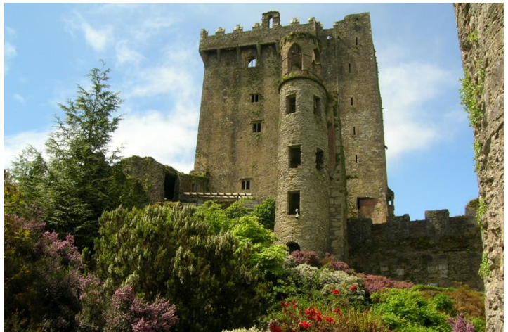
Clockwise from Top Left: Dublin Castle; Kylemore Abbey; Blarney Castle; Cliffs of Moher