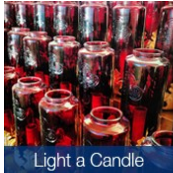
Light a Candle