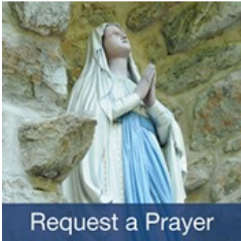
Request a Prayer