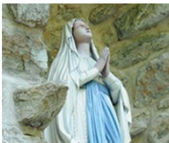
Request a Prayer