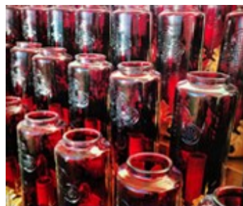
Light a Candle