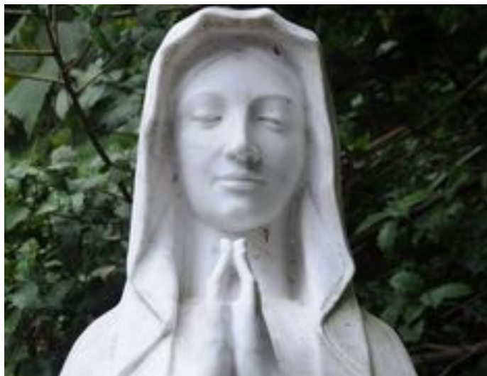
Our Lady of the Rosary October 7, 2019

Forgiveness is not condoning what the offender has done. It does not mean we have to become palsy-walsy with that person. In fact, it is not even always necessary that we see that person again. But for our own physical health, it is best for us personally that we forgive. It is very harmful to our health that we continue to recall and relive what has been done by another person and getting ourselves, all worked up over it again and again. We are to learn from the experience, grow from the experience, and move on with our lives. Forgiveness of others, and forgiveness of ourselves, helps us to leave mistakes and tragedies and horror behind.